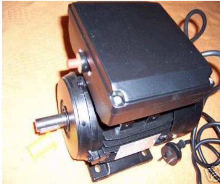
A normal one HP electric motor

Below is Panacea's replication of .8-1.13 1 HP (horse power) RV modified motor, if used in an identical role the motor will draw only 160 Watts when idling! And when loaded at 1HP, is estimated to be about at a 94+% constant efficiency.