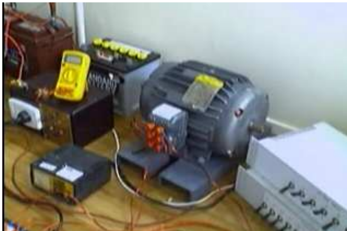
Panacea's replication showing a BALDORS RV motor modified for energy saving applications.

Below is Panacea's replication of .8-1.13 1 HP (horse power) RV modified motor, if used in an identical role the motor will draw only 160 Watts when idling! And when loaded at 1HP, is estimated to be about at a 94+% constant efficiency.